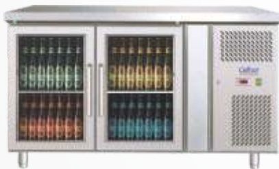
Undercounter Back Bar (GN 2100 TNG)

Elegant yet reliable Undercounter Back Bars made in sturdy stainless steel that are designed to enhance the efficiency of professional bartenders. Perfect for showcasing bottled and canned drinks and giving you high capacity & high visibility storage and display options.