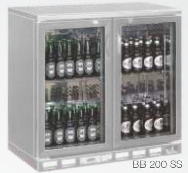
BB 200 SS