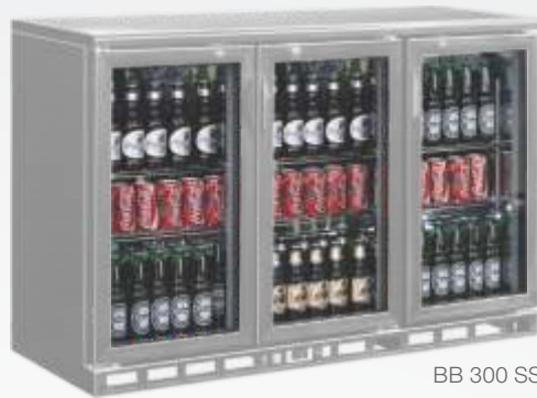
BB 300 SS

High performance Back Bars with refrigerated display, available in elegant black colour and stainless steel that can be specified as part of a complete bar solution or individually.... giving you endless possibilities in bar design. They create maximum display area and allow rapid restocking and cooling. Black Back Bars are highly cost-effective too.