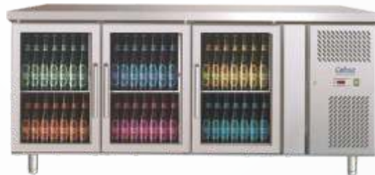
Undercounter Back Bar (GN 3100 TNG)